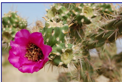
Jumping Cholla & Flower