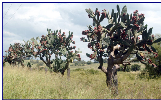
Prickly Pear Infestation