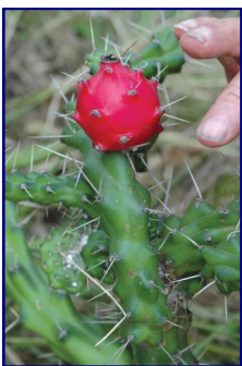
Harrisia Cactus fruit, stem & spike

Cactus Fact Sheets are also available from the Longreach Visitor Information Centre