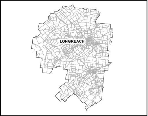
Zone Map - 01